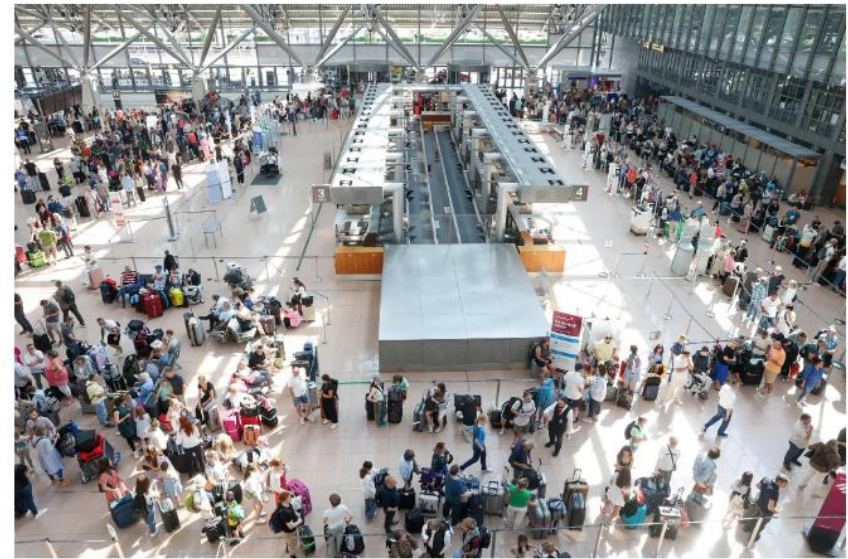
Travelers waiting to check in at the airport in Hamburg, Germany, on Friday.

Share full article Share Bookmark Comments 951