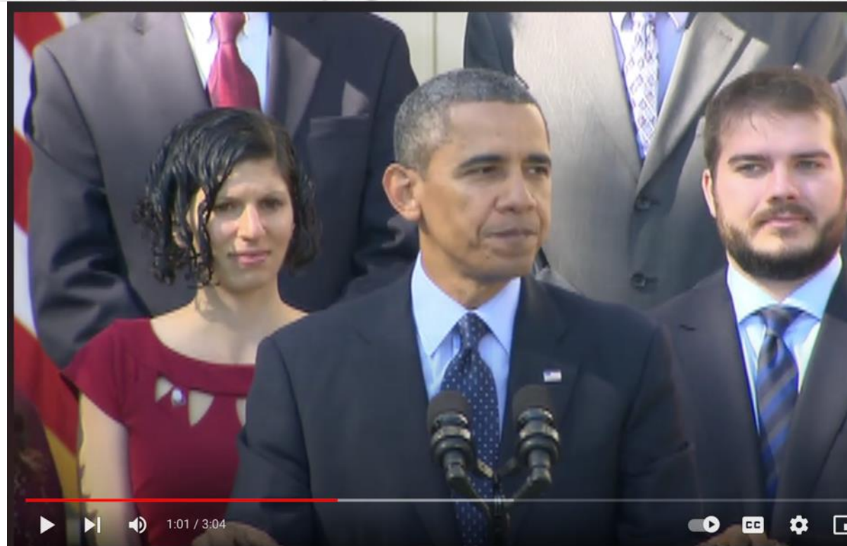
Obama Speech Today on Tech Problems of HealthCare.gov | The New York Times

The Patient Protection and Affordable Care Act, better known as Obamacare, will probably be remembered as President Obama's most important domestic policy initiative. However, inept federal management of the HealthCare.gov